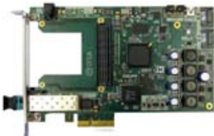
Commercially available SPEC card